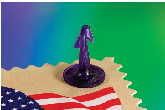
FIG. 1: Above is a Micromolded tack placed in the corner of a standard U.S. postage stamp. In the Microworld, both the physical size of the part, as well as the physical size of the features on the part (see the two barbs protruding from the center shaft), are relevant.

The micro-world is a very different place. When distances are measured in microns (0.00004"), and when a single pellet of raw plastic can produce literally dozens of individual finished parts, many of the macro-world's accepted conditions and interactions just do not apply, especially when complicated by challenging materials such as PEEK, ULTEM, or the fragile and expensive new entries in the Bioresorbable field. This is the world where MTD lives, and where the company works daily on the "Edge of Science"™ to expand the frontiers of injection molding knowledge of the Microworld.