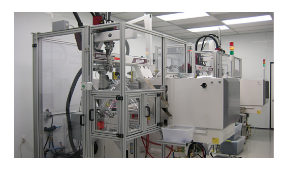
FIG. 3: MTD MicroSeries™ manufacturing is fully isolated and completely controlled. Each work cell is self-contained and resides in a Class 8 Cleanroom. Each cell is equipped with a customized optical measurement system feeding a computerized data collection and analysis system. All part movements are designed to take advantage of precision automated material handling robotic systems, and parts are never handled manually.

This powerful suite of technologies and knowhow affords customers the benefits of creating designs which previously were not producible. Furthermore, the scientific understandings support the engineering practices leading to manufacturing repeatability, process optimization, and ultimately, world-class value.