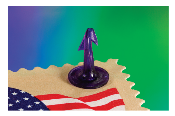
FIG. 1: Above is a Micromolded tack placed in the corner of a standard U.S. postage stamp. In the Microworld, both the physical size of the part, as well as the physical size of the features on the part (see the two barbs protruding from the center shaft), are relevant.

The micro-world is a very different place. When distances are measured in microns (0.00004"), and when a single pellet of raw plastic can produce literally dozens of individual finished parts, many of the macro-world's accepted conditions and interactions just do not apply, especially when complicated by challenging materials such as PEEK, ULTEM, or the fragile and expensive new entries in the Bioresorbable field. This is the world where MTD lives, and where the company works daily on the "Edge of Science"™ to expand the frontiers of injection molding knowledge of the Microworld.