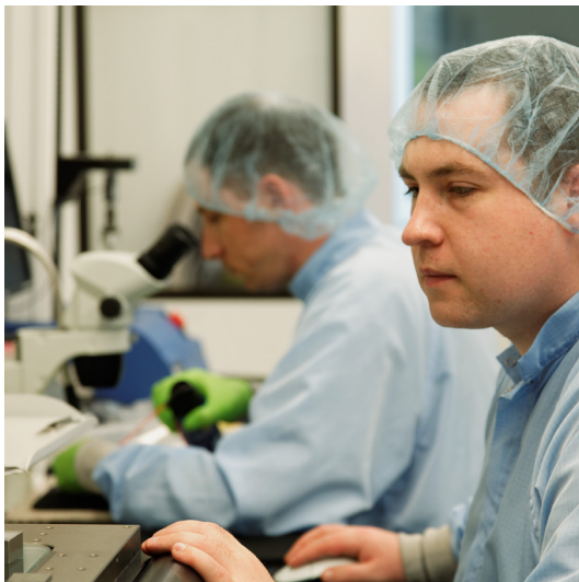
FIG. 3: “Some of best Micromolding work we do is performed in the laboratory.” MTD has learned that a “Flawless Launch” requires a complete understanding of the behavior of each material as it responds during the molding process. This is especially true for fragile materials like those in the Bioresorbable family, or permanent resins which are otherwise challenging, like PEEK.

Knowing this limit, though, is much easier than achieving it. To move this understanding into application requires a thorough understanding of the other “5 Sciences” (see Fig. 1, above), ranging from Micro-Part Design to Micro-Material Handling and Packaging. Also necessary are the Micro-systems and hardware to achieve “low IV loss.”